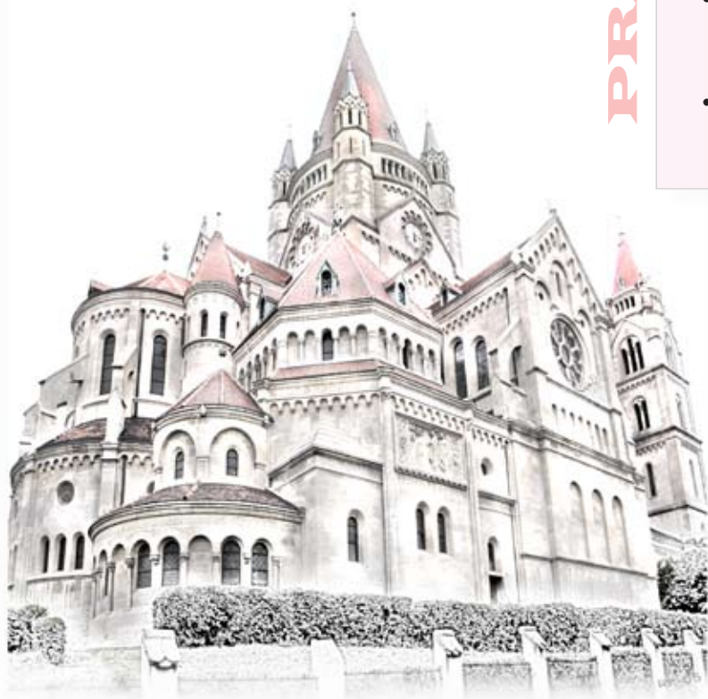
Church of St. Francis of Assisi on the Danube - Vienna