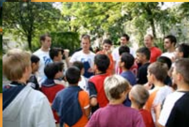
PARK SOCCER OUTREACH to inner-city kids