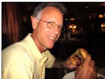
Enjoying my first BUFFALO BURGER in Georgia