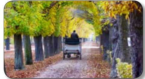
fall day in Vienna

SO SHE SAT THERE OPPOSITE OF ME, TAKING OUT HER BIBLE :) :) :) and SHOWING ME WHAT SHE READ .... and telling me she really thinks GOD wanted her to read!!!!!!!!!!!!!!!!!! YEAHHHHHH!!!