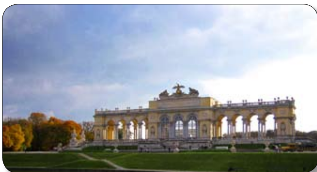
Vienna's Schönbrunn in the fall