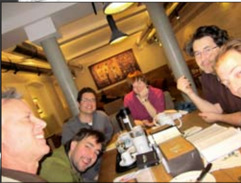
Saturday morning study is targeting the future leaders of Austria

Another lady met a stranger the day of the fellowship and invited him to the Bible study. He wandered in without anybody knowing who he was. The young people gathered around welcoming him and genuinely cared for him. He said he had been in Vienna nearly a year and didn't have one friend. I looked him squarely in the eyes and told him, "That just changed." I invited him to our Saturday morning group, and he has been with us ever since. This man was told about Christ eighteen years ago, became a believer but was never taught how to grow in his relationship with God.