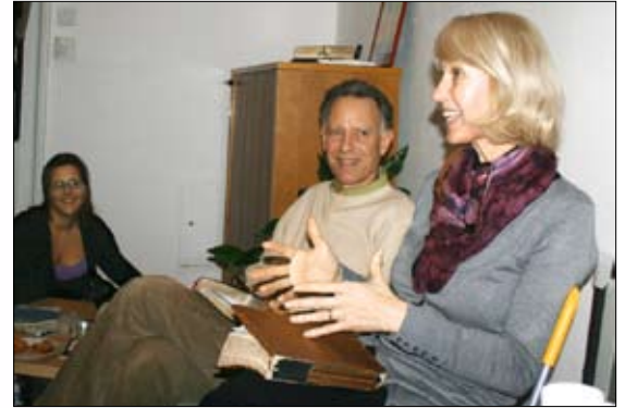
Sharing our testimonies