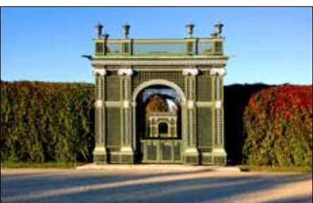
First days of Fall at the famous Schönbrunn