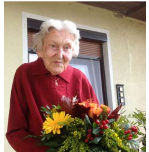
Omi (Monika's mother) turned 90

If you want to support God's work in Austria, please send checks to the NEW address below.