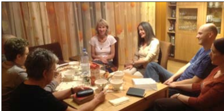
a Friday night study