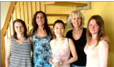
girl's Bible study