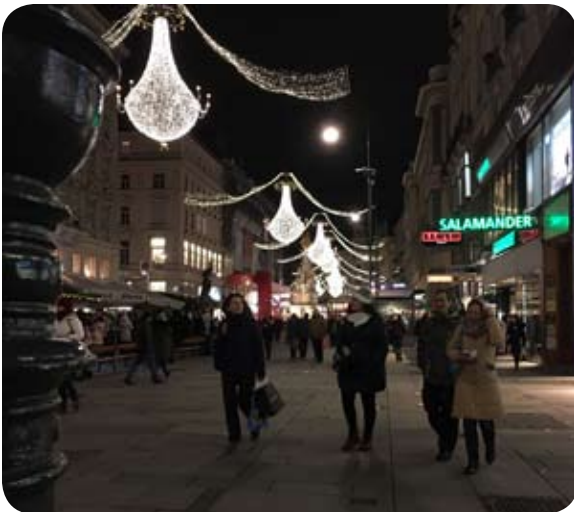
One of the main shopping streets in the heart of Vienna