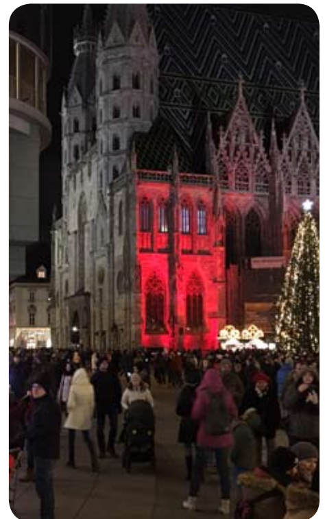
St. Stephan's Cathedral at the Center of Vienna